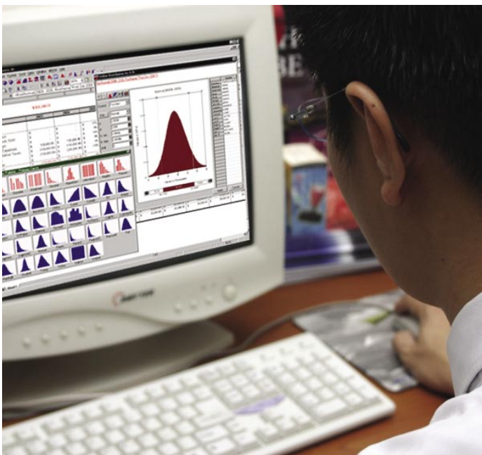
Make better decisions with Palisade Training.

But who has the time to perform risk and statistical analysis – or to even learn how? The reality is that comprehensive quantitative analysis doesn't have to be complicated or time-consuming. Look no further than Palisade Training and Consulting. We'll show you how to apply valuable analytical techniques without having to go back to college. Analyses such as simulating thousands of scenarios or uncovering trends in your data are within your grasp – techniques that could save you time and money!